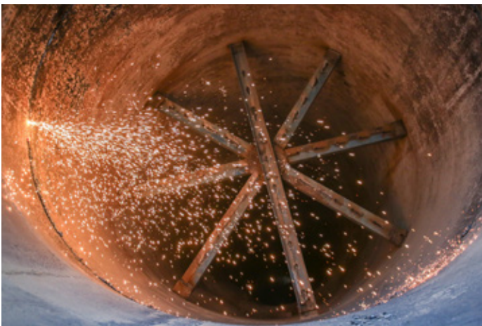
Cutting of the damaged kiln shell portion.