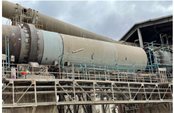
Alignment of the Blue Triangle Cement kiln shell.