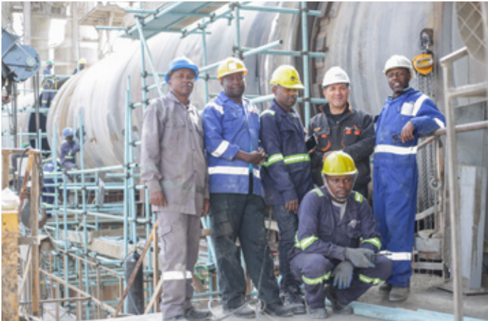
The power faces behind our kiln upgrade project.