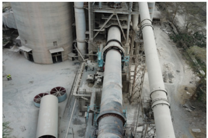
An aerial view of the highly damaged section of the burning zone to be replaced.