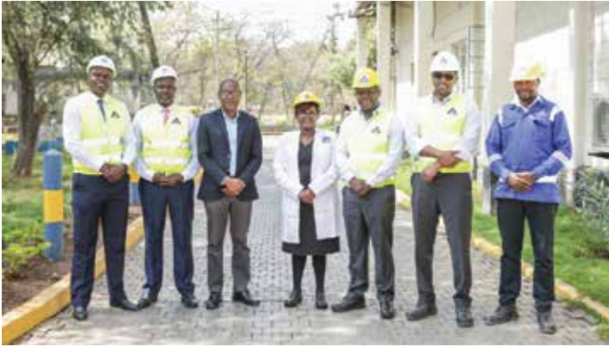
Members of the Executive Committee pose for a group photo outside the Managing Director's Office as they wait for the Board of Directors to arrive.