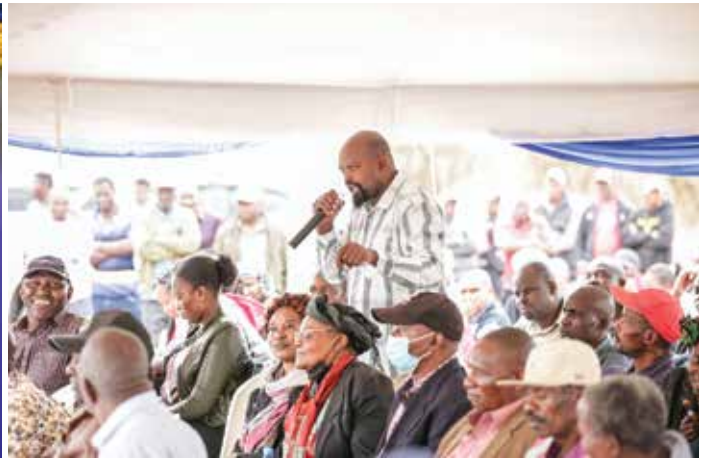
One of the Squatters who attended the Public Participation Meeting gives his views.