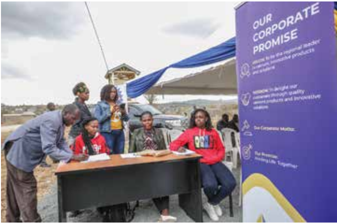
Residents at the registration table before start of the meeting.