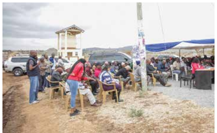
Residents follow proceeding during the meeting.