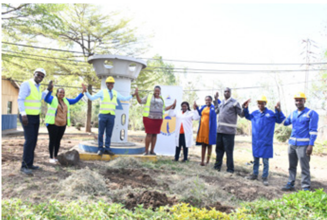
Colleagues pose for a group photo after the tree planting exercise.