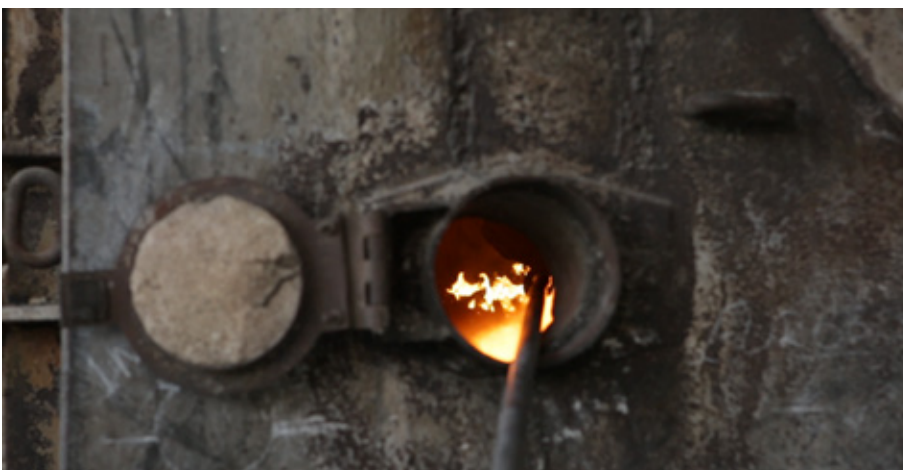
A view of the kiln's burner pipe after firing.