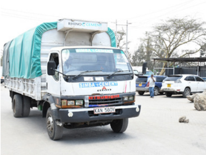
A Cement Truck leaves the Lorry Park after loading cement. Traffic has increased since resumption of full operation that assured consistent product availability.