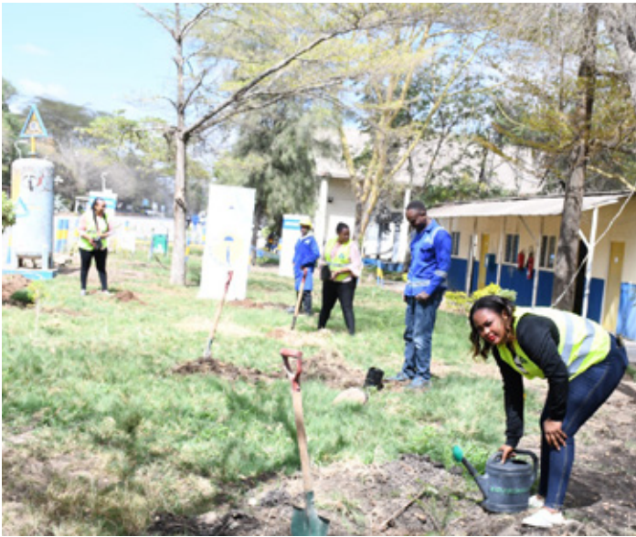
Colleagues during a recent Tree Planting Exercise. Planting Trees is one of the ways of reversing Climate Change.