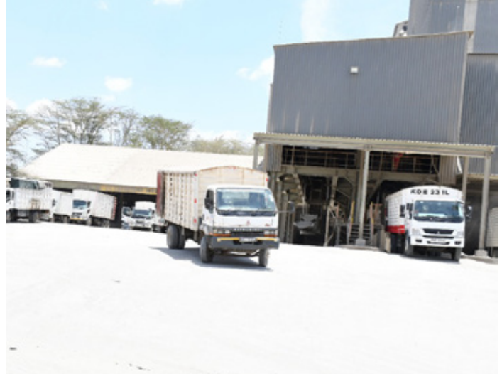
Trucks at the Packing Waiting to load Cement. Consistency in production has help us regain customer confidence making them send more of their trucks.