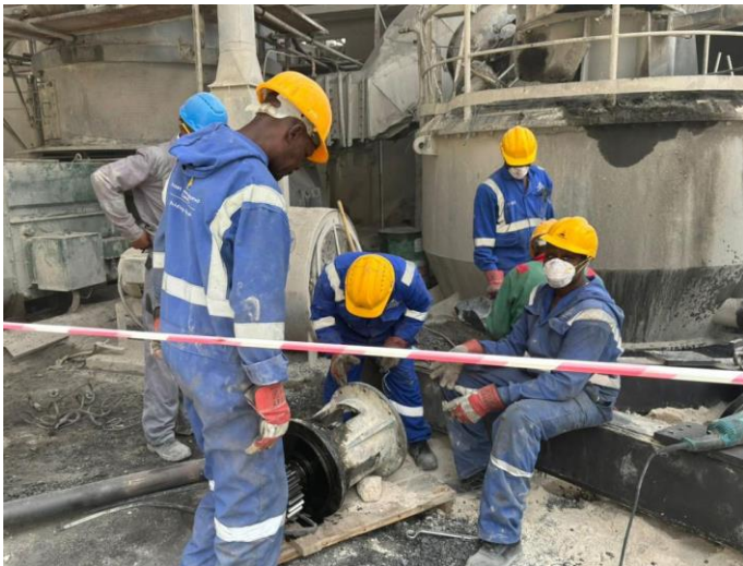
The shutdown team working on the Kiln's burner pipe

Additionally, the replacement of filter bags is 95% done, awaiting Commissioning, while the job in the cooler is 66% complete. These essential components play a crucial