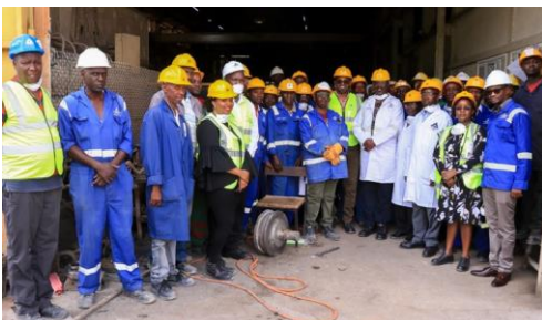
The Board Technical Committee Members pose for a photo with Colleagues at the Mechanical Workshop