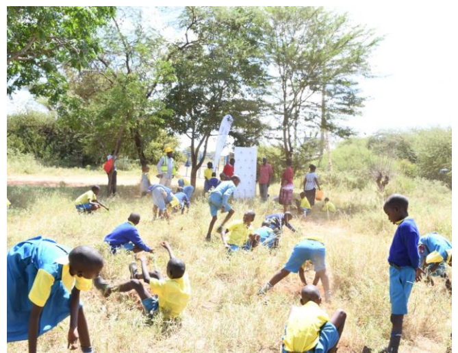
Pupils from Kibini Primary School actively participate in the Tree Planting Dive