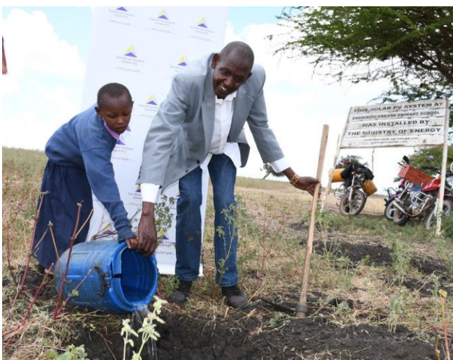
A Girl from Endnyo Enker Primary School is assisted to water a tree she planted by a Teacher