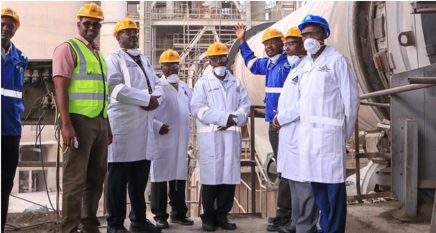
The Board Technical Committee with some members of Executive Committee outside the Kiln