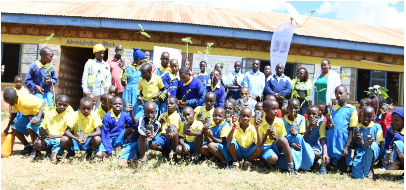
Pupils of Kibini Primary School prepare to plant trees