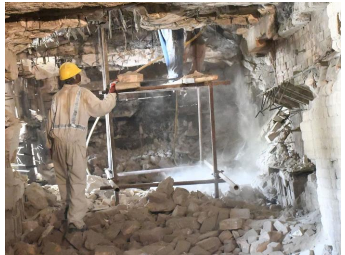
Ongoing jobs at the grate cooler

role in maintaining environmental standards and optimizing air quality within the factory premises. Through the systematic installation of new filter bags, the EAPC-PLC Factory reaffirms its dedication to sustainability and environmental responsibility.