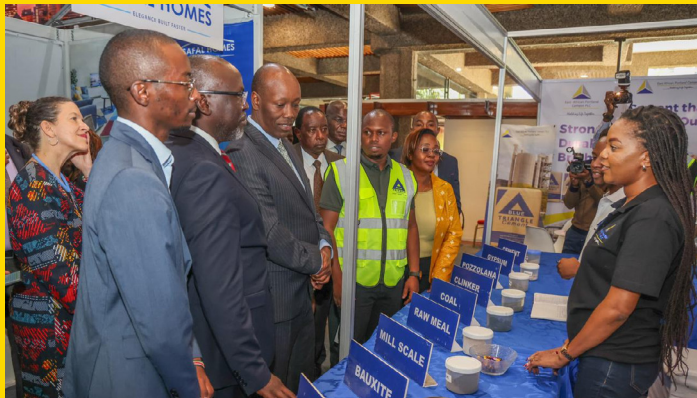
Lee Kinyanjui- Cabinet Secretary, Ministry of Investments Trade and Industry engaging in an interactive session with our PR and Marketing team at the Changamka Festival 2025.

East African Portland Cement PLC proudly stood among the key sponsors of this year's 8th Edition of the Changamka Shopping Festival, held at the Kenyatta International Convention Centre (KICC) from November 4th to 8th. The event brought together Kenya's leading manufacturers, innovators, and consumers in a vibrant celebration of locally made products.