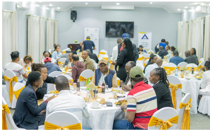
The Customer Dinner in Mt. Kenya Region

As the evening wrapped up, it was clear that the Embu