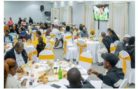
Customers engage with each other at the Dinner.