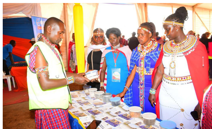
Visitors at the exhibition stand looking on as they learn about the cement making process

At EAPC, we are guided by our core values of integrity, stakeholder focus, and innovation. Our vision is to be a leading producer of premier cement and related products sustainably. We promise to hold life together, building strong foundations for our customers, communities, and the nation.